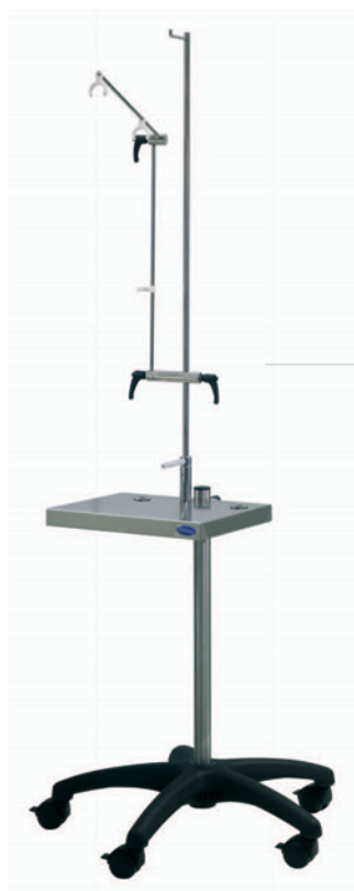
PROFI SONIC / PROFI SONIC H Movable stand, adjustable height Made of stainless steel Catalogue code: PSTS