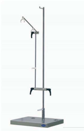
PROFI SONIC / PROFI SONIC H Table stand, adjustable height Made of stainless steel Catalogue code: PSDS